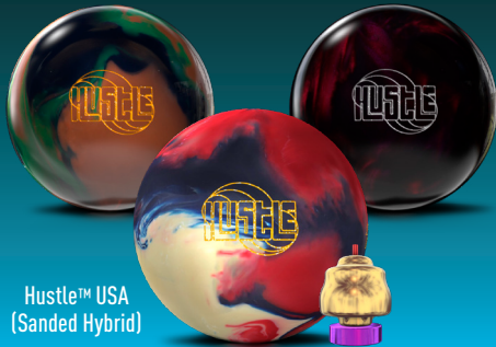
Hustle™ USA (Sanded Hybrid)