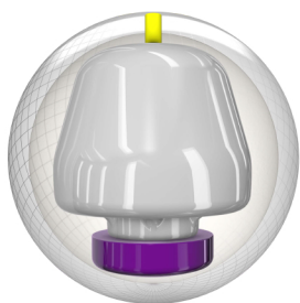
14-16 lb. Core