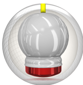
12, 13 lb. Core