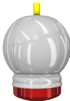
12, 13 lb.